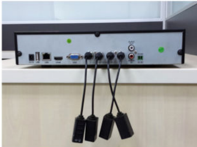
Old baluns make the cabinet a mess